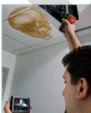
Ideal Applications: - Water Restoration - HVAC and Refrigeration - Electrical Inspection - Automotive - Pest control