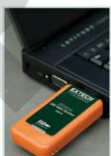
BRD10 - Optional Wireless USB Video Receiver allows user to stream live video to a PC and also can be remotely viewed via VOIP connection